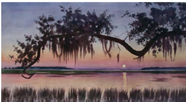
Spring Tide Sunset 24.5"x16"