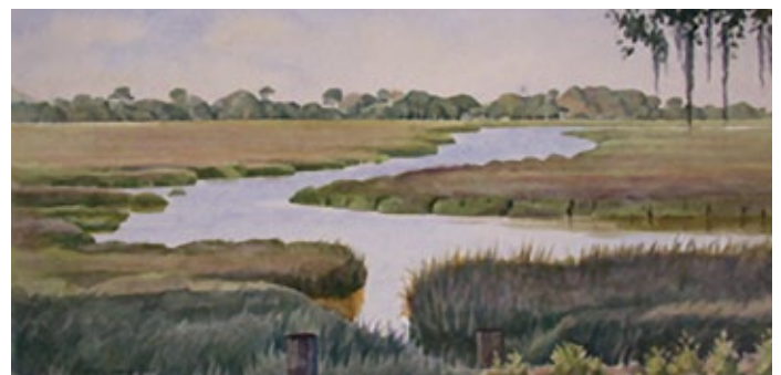
Spring Morning on Sapelo 24"x14.5"