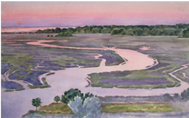
Estuaries - Sapelo 26"x18.5"